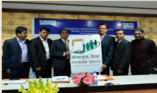
Some of the team members with the newly unveiled Mobile Seva logo (23-Dec-2013, the day the initiative was dedicated to the nation).