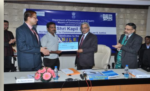
One of the winners of the Mobile App Development Contest organized under Mobile Seva for the best apps around public services (23-Dec-2013).